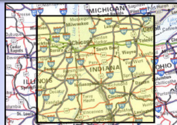
The New Jerusalem is a perfect square and is the size of several states, approximately 375 miles on each side.

6) What will be in the midst of the Holy City? -Revelation 22:2.